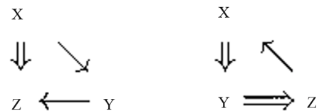
Figure 1. Triangle reasoning.

Two kinds of opposite relations can not be existence separately. Such reasoning can be expressed in Figure 1 . The first triangle reasoning is known as a jumping-transition reasoning , while the second triangle reasoning is known as an atavism reasoning . Reasoning method is a triangle on both sides decided to any third side. Both neighboring relations and alternate relations are non-compatibility relations (of course, non-equivalence relations), which are called two kinds of opposite non-compatibility relations.