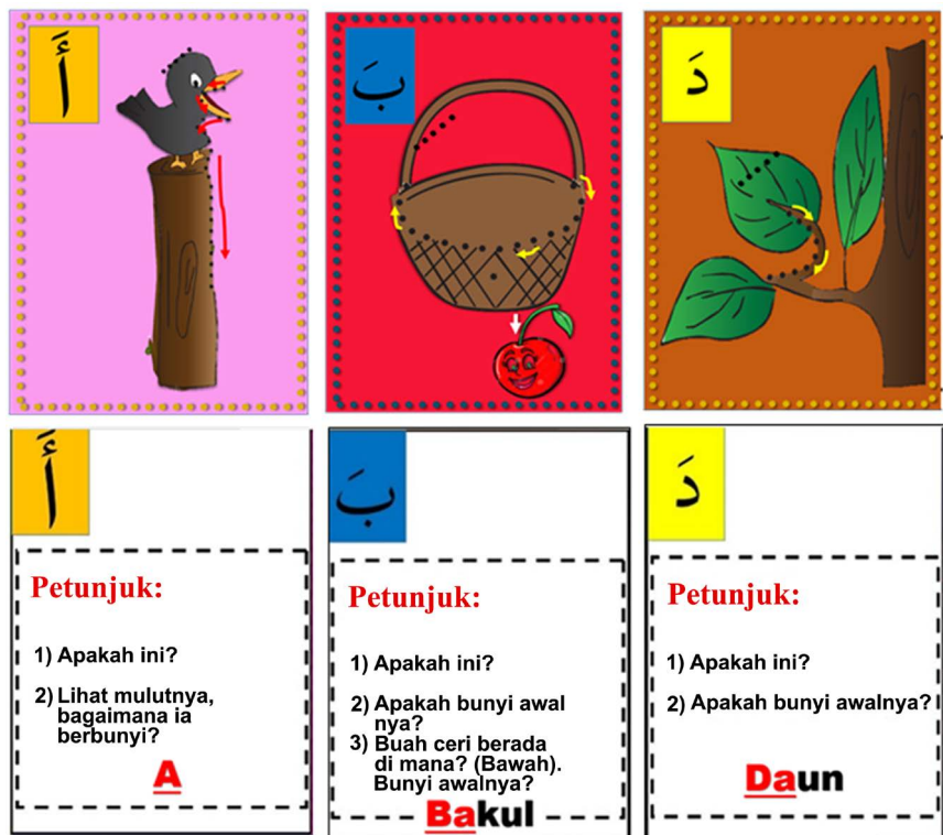
Figure 1. Imagine and read Arabic (InRA) interface.