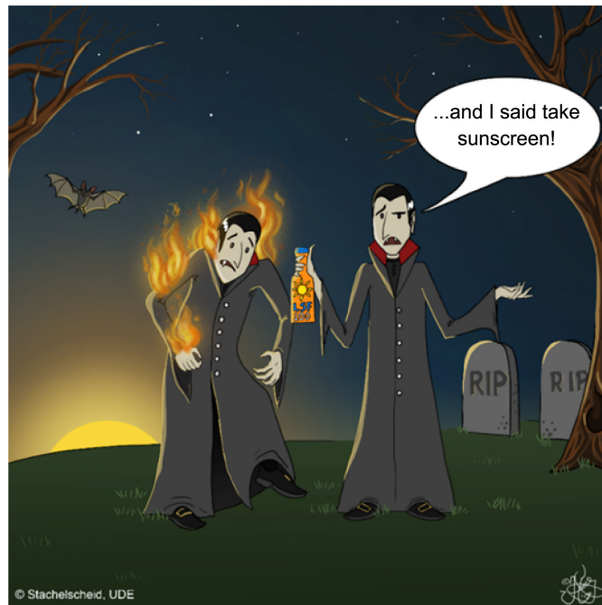
Figure 2. Cartoon with subject-specific humor.