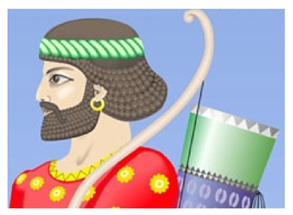
Figure 3. Persian soldier of Achaemenes era.

In Iran, despite the diverse activities that have been carried out in the field of general heritage education, the recurrent course has not been followed. This lack is observed, especially in the field of childhood and adolescent age education. However, over the years, there have been individuals and groups who have been concerned about this kind of education and have done some activities, but the importance and importance of teaching the heritage to the child is much greater than the range of activities carried out. For this reason, the Heritage School has devoted a large part of its activities to teaching children and adolescents, and is trying to fill the gap with the help of cultural heritage experts.