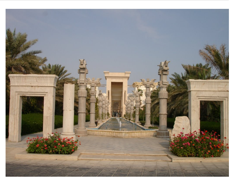
Figure 1. Entrance of a hotel in Kish Island, Iran.

An idea is to design the modern atmosphere of the city by the ideas inspired of the ancient style. City halls, bus and subway stations, shopping malls, etc. are some of the media to be considered for cultural heritage presentation via environmental graphics. Figure 2 shows a famous motif of Persepolis, reconstructed in a subway station wall.