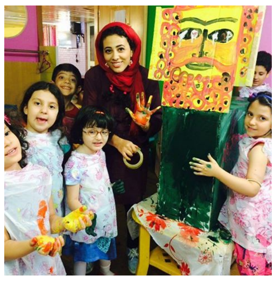
Figure 4. Persepolis motif by young students of primary school.

Given the children's emotional development process according to psychologist Erik Eriksson, cultural heritage sights are appropriate places for linking information to day-to-day issues, but unfortunately, in most countries with rich cultural heritage, for many reasons, not much attention has been paid to problem-solving literature, while in addition to teaching solving skills Critical