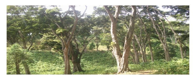
Figure 2. Culturally protected forest land.

Open grassland is the land use type predominantly of very short grasses and situated within the protected area as shown in Figure 3. This land use system is denuded of trees, shrubs and bushes and open for grazing. Protected forest and open grassland are both within the culturally protected area and their main difference is vegetation cover and free access for open grazing.