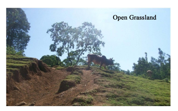
Figure 3. Open grassland within the protected forest area.

Grazing land is also one of land use systems where a group(s) of farmers are using for grazing their cattle as a common land, which is considered as communal grazing land ( Figure 5 ). Other than direct inputs of cow dung and urine to the grazing land, no other soil inputs are applied to the grazing land by the owners.