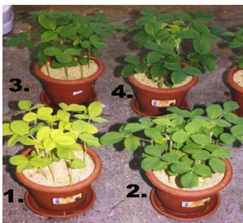
Figure 3. Demonstrative effect of the application of bio alginates during the replanting of vegetation. Experimental container no. 1 was not treated with bio alginates at all. Container no. 2 was only treated by one-time watering with a diluted B.A. preparation. In the case of container no. 3, the watering was combined with the application of B.A. root concentrate, while container no. 4 presents the effect of the application of watering with a root concentrate and the application of B.A. granulate to the soil substrate ( the producer's company materials were used ).

Second experiment to demonstrate positive effects of bio alginates was a