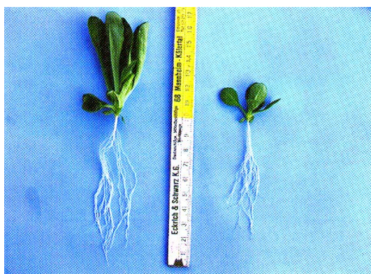
Figure 2. Comparative presentation of two young experimental plants—on the left: growing under the effect of bio alginates and on the right: without their effect ( the producer's company materials were used ).