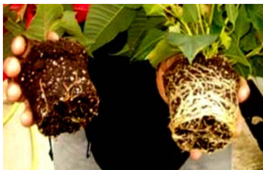
Figure 1. Model illustration of the effect of bio alginates on the development of the root systems of potted plants (plants of the same type and origin, planted in identical soil and cultivated under exactly the same conditions). They differ only in that the plant on the left was watered with clean water, while water with bio alginate content was used on the plant on the right. The differences in the richness of the root stitching are clearly evident.

Apart from the fact that bio alginates induce and subsequently support the development of a stronger root system, in this way they also stimulate the plant to increase its fertility. Of significance is also the verified fact that bio alginates—or the consequences thereof—are effective in the soil for 1 - 3 years. A basic principle of the utilization of bio alginates during managed and rehabilitative plant cultivation is the stimulation of their growth using a concentrate of polyuronic acids, amino acids, phytohormones and trace elements, contained in used products with bio alginate component content. These effective substances affect all green plants in general, by accelerating and intensifying their life functions, and increasing photosynthesis and substance exchange. At the same time, the plants develop harmoniously, and fully utilize their genetic potential. The natural form of support for the development of the root system is also closely linked to the development of a stronger and healthier aboveground part ( Figure 1 and Figure 2 ).