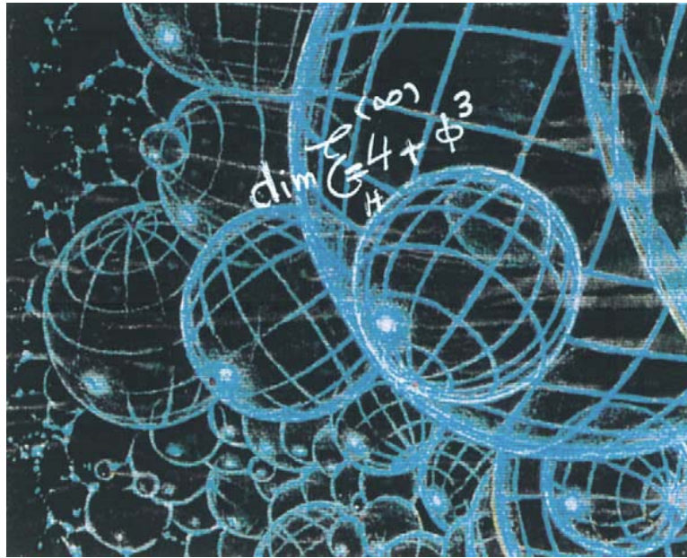
Figure 2. Banach-Tarski sphere decomposition Cantorian spacetime of E-infinity theory that is considered here to model our actual spacetime may be envisaged advantageously as in this artist impression. This is basically a two dimensional projection in which each of the larger balls (circles) are a zero set (0; \phi) representing the quantum particle while the surface (circumference) represents the empty set (-1; \phi^2) which in turn represents the quantum wave [1] [17]. This wave is then surrounded by an infinite hierarchy of smaller (fractal) spheres (surfaces), which may be seen as the emptier set (-2; \phi^3) , i.e. the surface of the empty set quantum wave. Remarkably the average set of all zero and empty sets is an expectation value equal \langle -2; \phi^3 \rangle . In other words \langle -2; \phi^3 \rangle is our quantum spacetime, which is the cobordism of the quantum wave, which in turn is the cobordism of the quantum particle, floating and propagating with the help of its wave in our Cantorian E-infinity spacetime [1] [2] [10] [11]. It is likewise remarkable that \phi^3 is simultaneously equal to the topological Casimir force as well as the topological mass of the ordinary energy of spacetime. Thus all matter and energy manifestations in our cosmos are essentially a manifestation of the zero point energy of the vacuum of spacetime. To obtain Einstein maximal energy density we just need to find first the topological energy density by adding Kaluza-Klein D = 5 to \phi^3 of the spacetime vacuum and find the fractal Kaluza-Klein dimension 5 + \phi^3 then multiply this with the average Cantorian interval speed of light c = \phi squared. The result is (5 + \phi^3)\phi^2 = 2 . Inserting in Newton's kinetic energy one finds E(\text{Einstein}) = \frac{1}{2}m(v \rightarrow c)^2(2) = mc^2 exactly as should be. The preceding explanation amounts to a paradigm shift in physics where the totally empty vacuum of spacetime is taken as fundamental and everything else is derivable from it. To prove this point was a dream of Serbian American inventor N. Tesla who died in 1943 as well as Soviet physicist A. Zakharov. In fact in his later years Nobel Laureate J. Schwinger was a champion of cold fusion [12] which comes very near to our present concept of a Casimir-nano energy reactor [10] [11]. We also stress that we are making tacit use of the Banach-Tarski decomposition theorem as a Schwinger-like source [18] [21] [34].