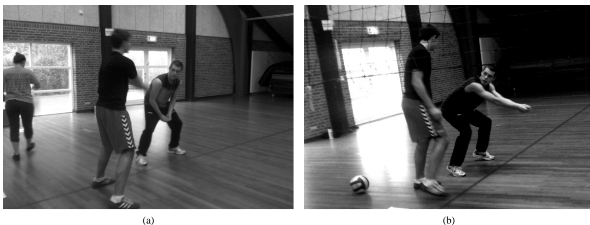
Figure 1. Two students exercise the position prior to a volleyball pass. The student to right gives feedback.

As seen in the photos the students were very concentrated and engaged during the exercises where they taught each other to bend down the knees ( Figure 1(a) and Figure 1(b) ) and to fold the hands correctly ( Figure 2(a) and Figure 2(b) ) when they were to execute passes in volleyball. The observations support findings from other studies (Goudas et al., 1995; Morgan & Carpenter, 2002; Reeve et al., 2004; Wallhead & Ntoumanis, 2004) in-