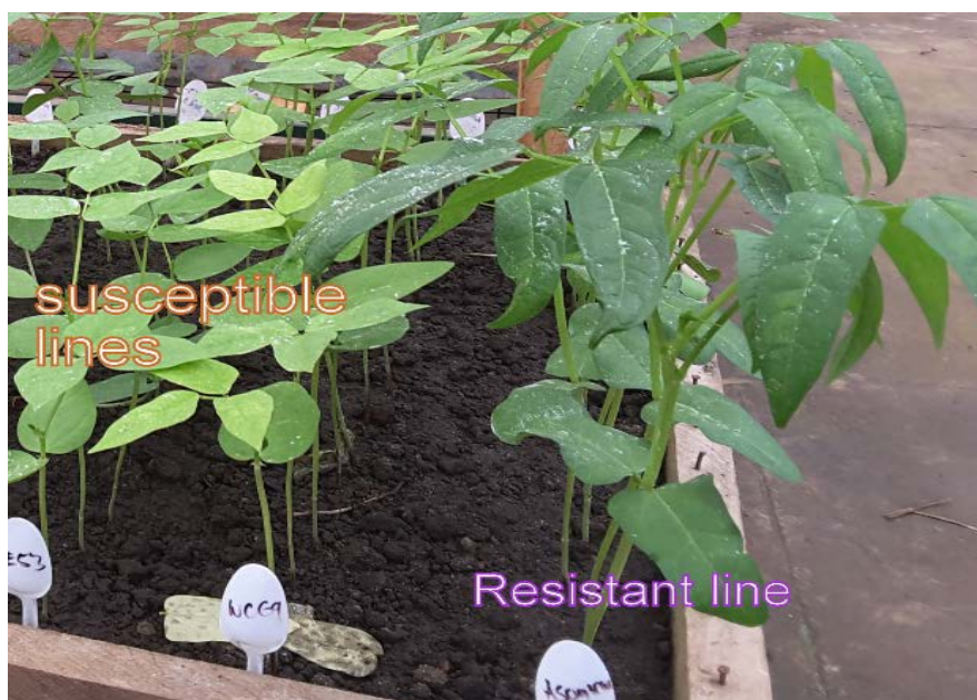
Figure 2. Resistant vs susceptible genotypes to F. redolens .

*, **, *** = significance at alpha 0.05, 0.01 and 0.001 respectively while ns = not significant.