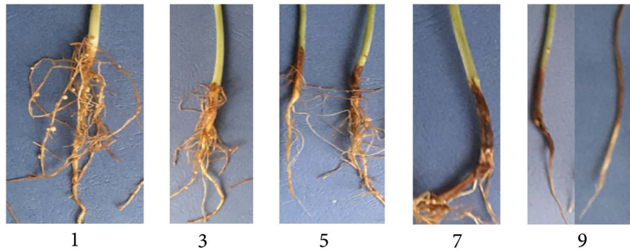
Figure 1. Photographic representation of the scale used to score root rot severity.

= effect of the k^{\text{th}} block confounded in the j^{\text{th}} replication, g_l = effect of the l^{\text{th}} genotype, gs_{li} = effect of the l^{\text{th}} genotype interacting with the i^{\text{th}} trial and e_{ijk} = the experimental error.