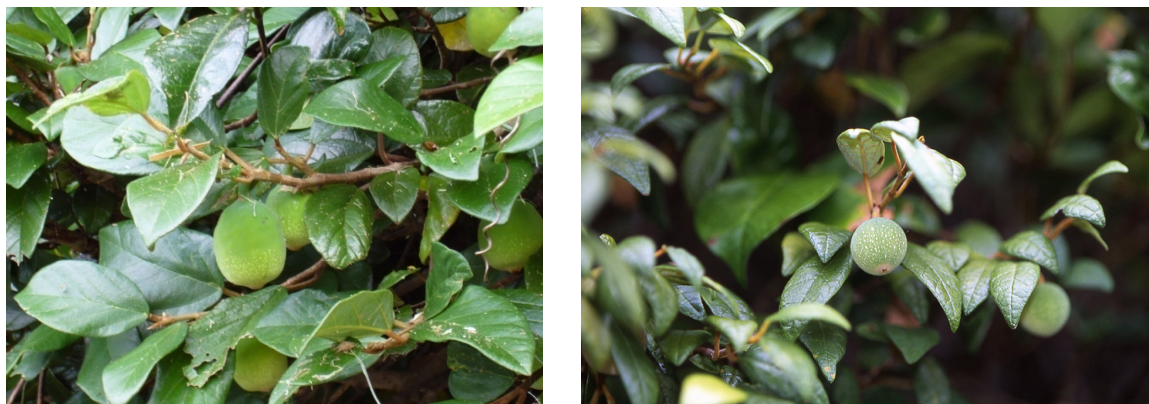
Figure 1. Appearances of two fig species used in this study. Left: Ficus pumila , right: F. thunbergii . Both photos were taken at Okinoshima, Kochi, western Japan.

Okinoshima is located off the shore of Kochi Prefecture, Shikoku, western Japan (Figure 2). We collected samples of F. pumila and F. thunbergii for analysis in 2010. Each sample was collected at least 50 m from neighboring samples to avoid resampling the same genets. Because not all individuals had syconia at the sampling time, we checked the morphological characteristics of leaves for exact identification of the two species when we collected samples: i.e. , almost glabrous on the abaxial side and a lateral nerve angle of less than 40° for F. pumila , and pubescens on the abaxial side and a lateral nerve angle of more than 50° for F. thunbergii [17]. In total, 42 individuals of F. pumila and 2 individuals of F. thunbergii were collected. Voucher specimens were deposited at