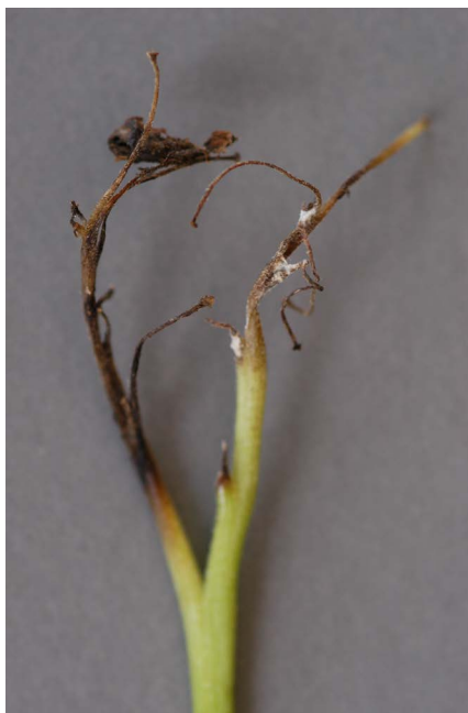
Figure 2. Blighted inflorescences with white mycelium of S. sclerotiorum growing from pedicel and peduncle tissues.