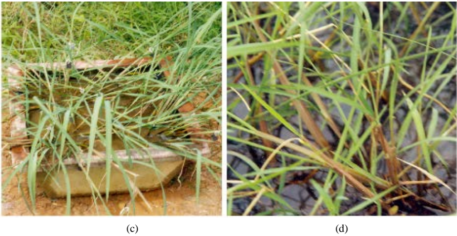
Figure 2. Tillering under cultivated condition (a), natural habitat (b) in O. nivara (upper) and under cultivated condition (c) and natural habitat (d) in O. rufipogon (lower).