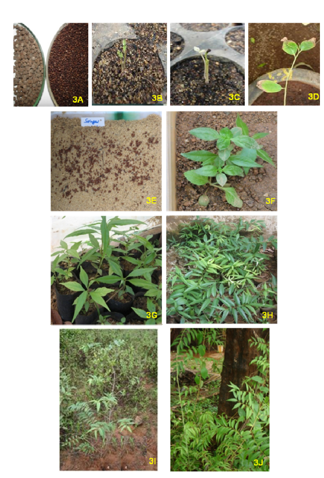
Figure 3. (A-J) Germination, nursery studies and field growth performance of Embelia ribes ; (A) Decoated seeds; (B) Albino seedlings at Bangalore nursery; (C) Normal seedlings in root trainers at Bangalore Nursery; (D) Drying of the seedlings from tip; (E) seed germination at Agumbe nursery; (F) Germinated seedlings at Agumbe nursery in trays; (G) Six-month-old seedlings at Agumbe nursery; (H) One year old seedling at Agumbe nursery; (I) One year old seedling at Agumbe forest area; (J) One year old seedling at Sirsi forest area.

mination (on germination paper) with in 6 - 7 days (emergence of radicle of 1 cm was considered as germinated; data not shown).