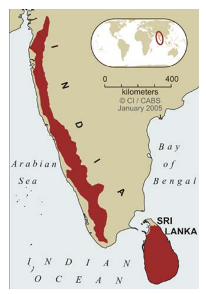
Figure 1. Location of Western Ghats in India.

climatic factors, such as, total annual rainfall and maximum temperature, and also in edaphic factors such as soil types and topography. It is reported that nearly 63% of the tree species of low and medium elevation in evergreen forests of Western Ghats are endemic due to unique matrix of climatic and edaphic factors [16]. Agumbe is amongst the highest rainfall receiving region in the Western Ghats, also earning itself the name, "Cherrapunji" of the South. It is felt that one of the most critical challenges of conservation of rare, threatened and endemic plants is to identify "ecological niche" and "amplitude of distribution" [17]. A species with low ecological gradient is of endemic nature because they cannot have a positive association with conditions outside their natural habitat. They are also referred to as "habitat specialist".