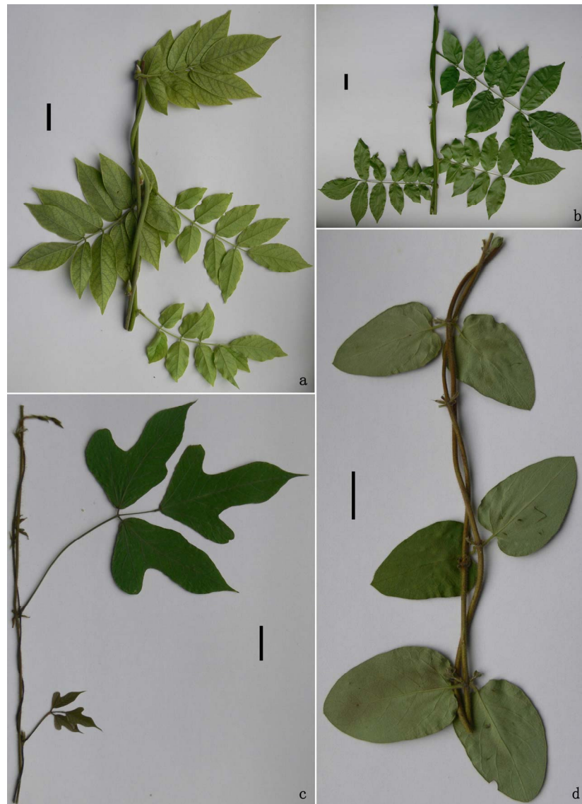
Figure 1. Distal branches of four extant, stem-twining plants cultivated at the Institute of Botany, CAS, Beijing. (a) Wisteria sinensis (Sims) Sweet, showing a right-handed twining and alternate leaves; (b) Wisteria floribunda (Willd.) DC., showing a left-handed twining and alternate leaves; (c) Pueraria montana (Lour.) Merr., showing a right-handed twining and alternate leaves; (d) Lonicera japonica Thunb., showing a left-handed twining and opposite leaves. Bars, 2 cm.

[22]) on the basis of mammalian faunas and radiometric data [23].