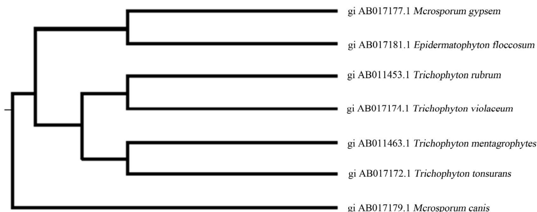
Figure 3. Result of cladogram (Neighbour Joining Tree plot) of dermatophytes on the basis of their ITS1 sequences. The NJ tree was constructed with data for standard strains of dermatophytes.

The oil at 2.5 \mu\text{l/ml} showed 100% inhibition against Microsporum gypsem , M. canis and Epidermatophyton floccosum which were closely placed in cladogram while 93% and 94% inhibition in T. violaceum and T. tonsurans and 100% static inhibition was found in Trichophyton mentagrophytes , T. rubrum which were clustered in cladogram as well ( Figure 3 ). Further, evaluation of the phylogenetic analysis and identification system, both of which are based on ITS1 rDNA sequences, are continuing in our laboratory with other species and strains.