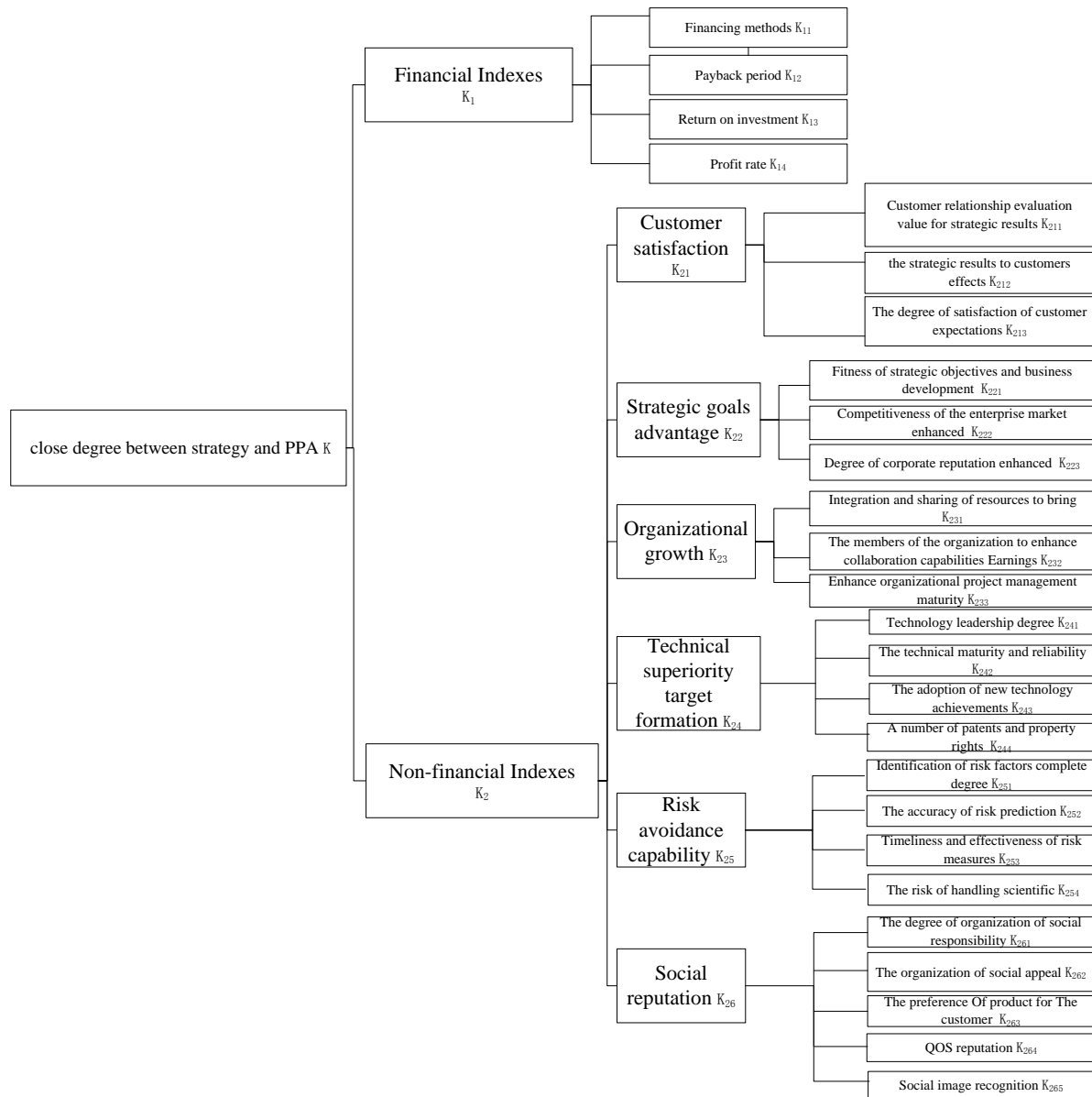
Figure 3. The system of evaluation indexes of the degree of closeness between strategy and PPA after optimization.