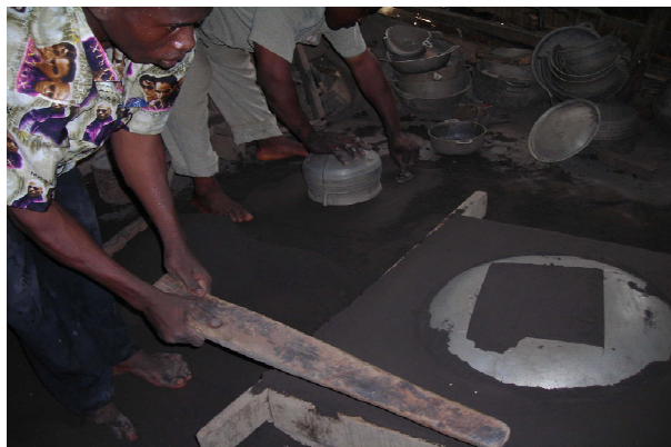
Figure 1. The process of sand casting.

It was observed that a large proportion of the practitioners are not well educated. The capability to cast advanced products (such as engine blocks, cylinder heads, hosing and other similar enclosures) which their method