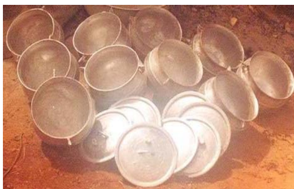
Figure 2. Finished aluminium pots.

of production can really produce has not been harnessed. Coupled with the foregoing, there was no evidence of interactions with tertiary institutions or knowledge centres that can help in improving skills as well as product and process development. This is in spite of the fact that one of the campuses of a frontline polytechnic (with various engineering courses) is situated within the same locality as the pottery cluster.