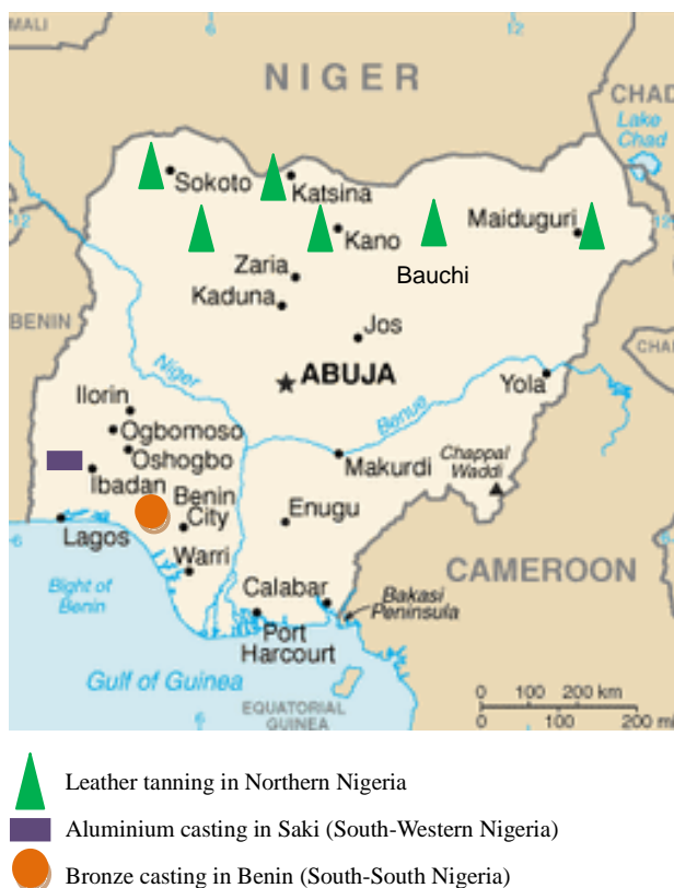
Figure 4. Map of Nigeria showing the study areas.

Indigenous Leather Tanning in Northern Nigeria ( Figure 5 ) is popularly referred to as “Jima”. It is done by