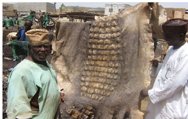
Figure 5. Tanned leather in Kano.

About 86% of respondents claimed that leather tanning is a family tradition. Thus their involvement in the trade has its root in the knowledge of the trade being well established in the family for many generations. Others held that their involvement in the trade is based on personal interest, independent of family attachment. Respondents