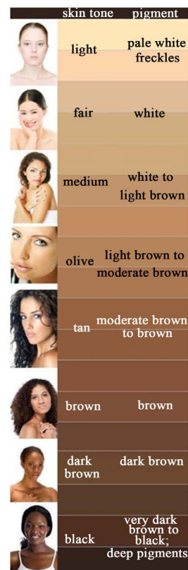
Figure 1. Operationalizations for coding foundation shades offered by brands.

The author and one of three coders tallied the total number of shades available from these 49 beauty brands while another coder tallied the types of shades available (see Figure 1 ). Categories in the coding book were defined by observations of the shades of foundation provided on each of the 49 beauty brand’s web