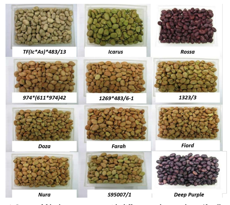
Figure 1. Image of faba bean genotypes with different seed coat colours (for illustration purposes only).

The image of 12 faba bean genotypes with different seed coat colours is illustrated in Figure 1 . Seed coat colours as measured by the CIELAB colour system, seed weight and description of 12 faba bean genotypes are shown in Table 1 . The violet-coloured Deep Purple and red-coloured Rossa had the lowest L* value, followed by green-coloured Icarus and other buff-coloured genotypes. As expected, TF(Ic*As)*483/13 had the highest L* value, due to its white-coloured