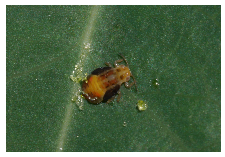
Figure 1. Agonoscena pistaciae nymph feeding on leaf.