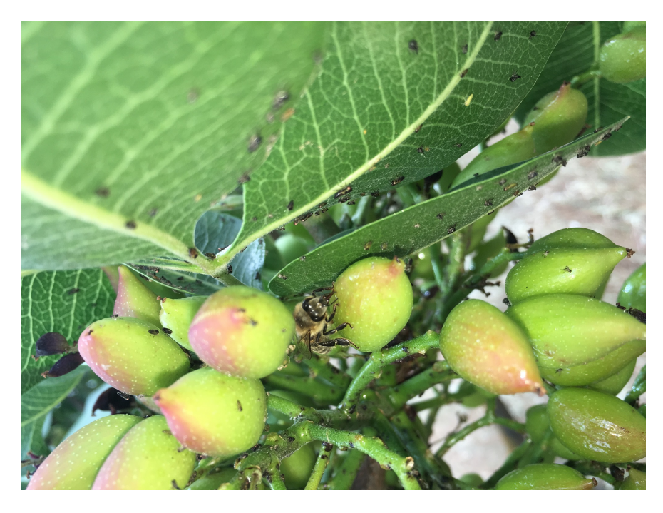
Figure 2. Forager honeybee collecting honeydew from pistachio tree infested by Agonoscena pistaciae.