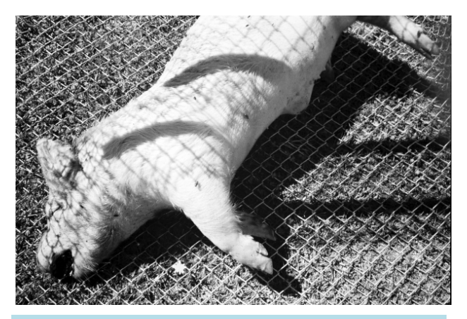
Figure 4. Bloated sunlit