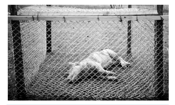
Figure 2. Fresh sunlit.

Fresh from the moment of the death until abdominal distension becomes evident. The first insects that arrive to the carcass are flies of the families Calliphoridae and Sarcophagidae that deposit their eggs or larvae, according to the family, in the natural openings of the head and genito-anal area, as well as in wounds if any (Figure 2 and Figure 3).