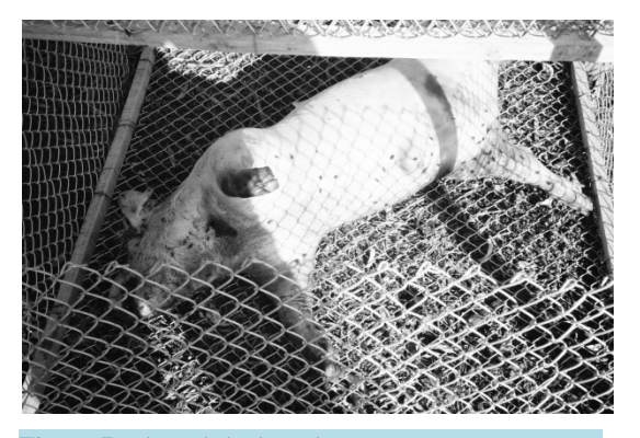
Figure 7. Bloated shadowed.