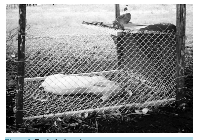
Figure 3. Fresh shadowed.

Skeletal reduction: bones and hair. Presence of acari in the ground. The variations of the fauna of ground can be detected after months or even years, depending on the local conditions [1] (Figure 10 and Figure 11).