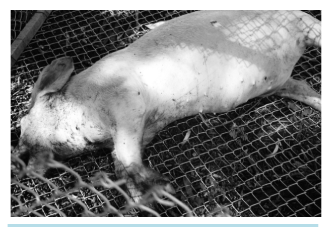
Figure 5. Bloated shadowed.