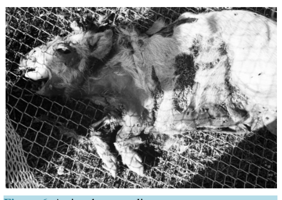
Figure 6. Active decay sunlit.