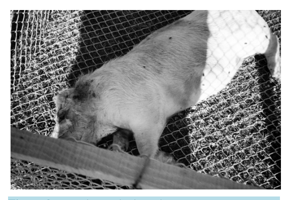
Figure 9. Low decay shadowed.