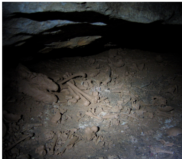
Figure 5. Long bones stacked amidst many smaller fragments. A majority of the surrounding osteological scatter is long bone fragments.

Operation VII, resembling the plaza in Operation IV, was clearly constructed for public ritual. Operation VIII on the other hand is broken by formations and so lends itself to private rituals. The floor of Operation VIII is mostly travertine and contains many shallow pools fed by water dripping from formations throughout the year.