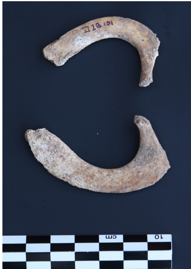
Figure 6. Two of the three subadult individuals in Operation VI Lot 02 top to bottom: Left rib 1 (VI-02b-101) and right rib 1 (VI-02b-45).