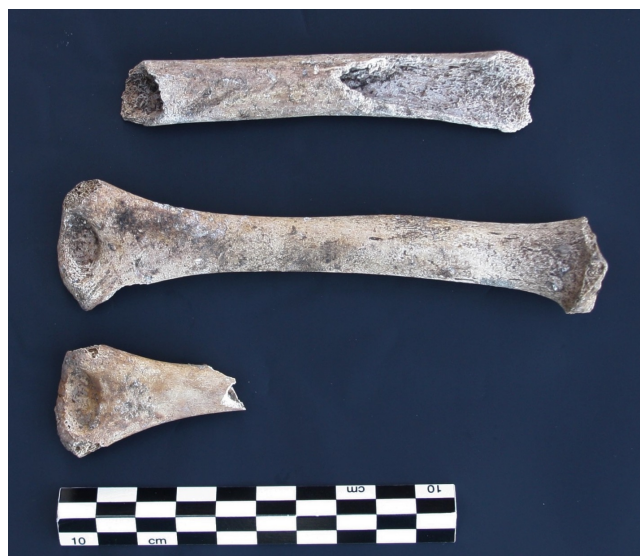
Figure 7. Three of the four subadult individuals in Operation VIII Lot 13 top to bottom: left humerus diaphysis (VIII-13-421), left humerus (VIII-13-260), and left humerus distal portion (VIII-13-117).