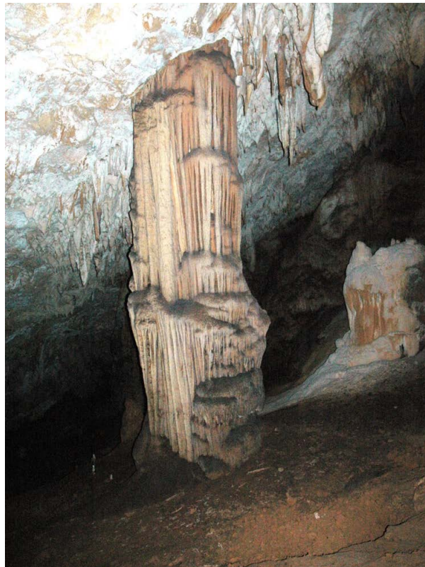
Figure 3. A leveled platform was constructed around this large speleothem in Operation V.