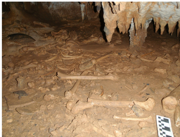
Figure 4. Bone scatter on the floor of the seasonal pool in Operation V.

of some of the long bones suggests secondary placement [Figure 5]. Space is extremely limited in this chamber so it is thought that, rather than being the site of sacrifices, it may represent a place where bone was deposited following the ritual cleaning of the public spaces in preparation for a new ceremony (Scott, 2009).