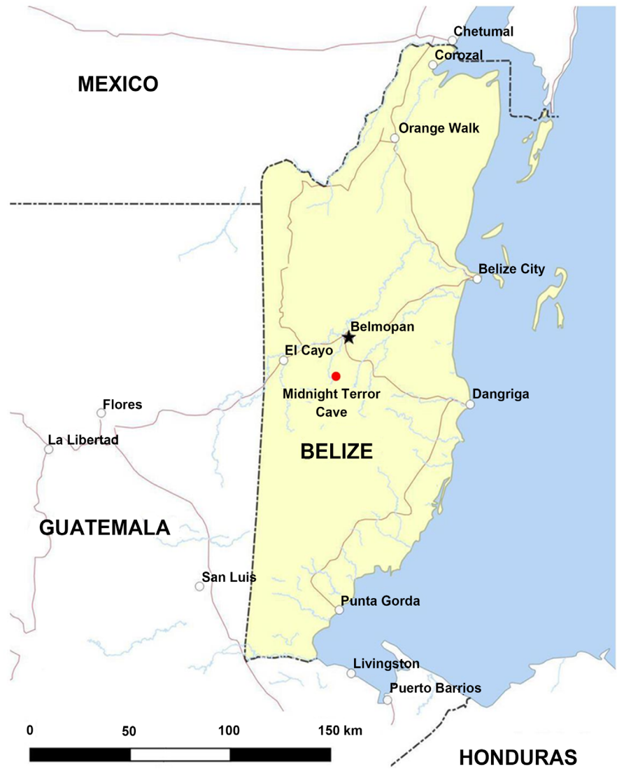
Figure 1. Map of Belize with the location of Midnight Terror Cave.