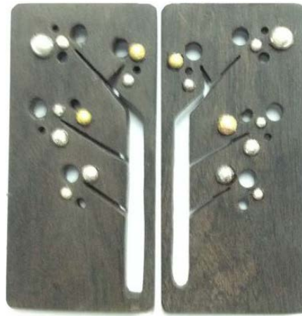
Figure 2. Pendant.

three-dimensional and layering effect to this handicraft. For avoiding the depressing feeling, the designer adopts many methods cause the jewelry to be lively and vivid. On part, seemingly disparate permutation contain certain rules. The chiaroscuro caused by yellow brass, white silver and ebony. Rectangle contrasts with round in shape. Fresh and natural visual effect of the works appeal to the tidal current of “Return to nature” (Qian, 2016).