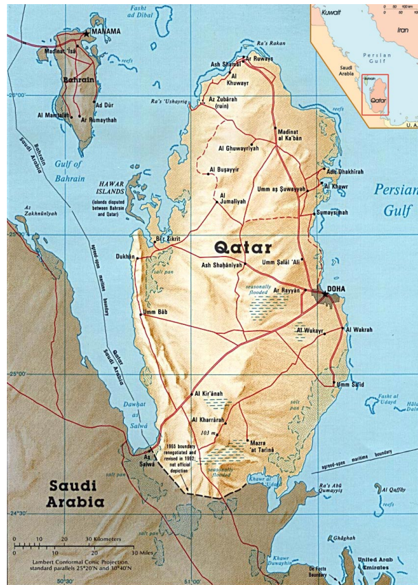
Figure 1. Map of Qatar.