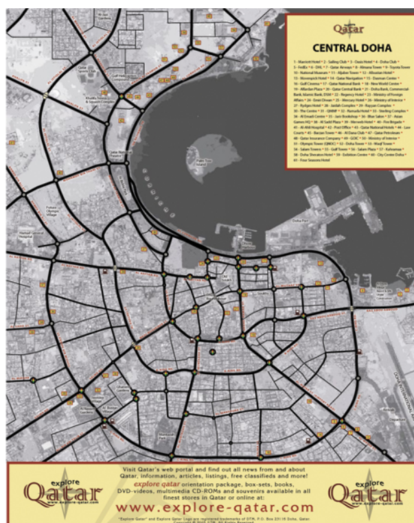
Figure 3. Development of the Doha central area.

Within the 21st century, this traditional market, enlarged to house three major shopping facilities. They consist of areas for whole sale and retail, mainly for food supplies; including dates and rice. Small shops sell handicrafts, sewing and cloth and the last area consists of an outdoor free market. The idea of shopping experience with these old shops was intimate with outdoor displaying and selling process, keeping the indoor area as a storage facility (see Figure 5 ).