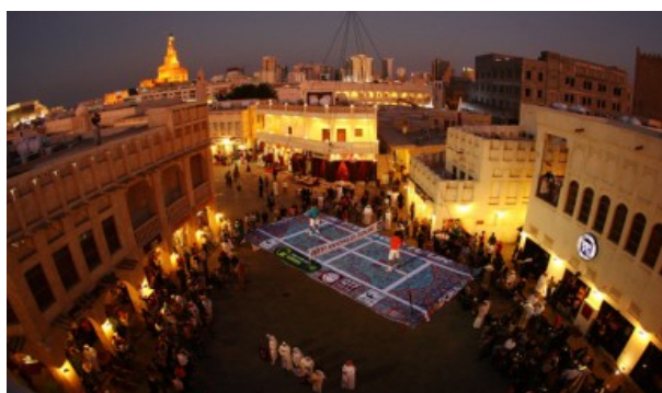
Figure 9. Souk Waqif, a living heritage day and night and a major landmark.

area taking a place over Al-Najada old Souk and reached from Al-Najada Street. The old Souk along alleys, comprise colorful ground spices displayed in boxes, sacks and huge tubes. In addition, there is space for gold, clothes, and animals (see Figure 10 ).