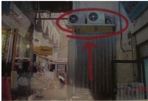
Figure 6. Inappropriate insertion of air conditioning units into the shop walls.