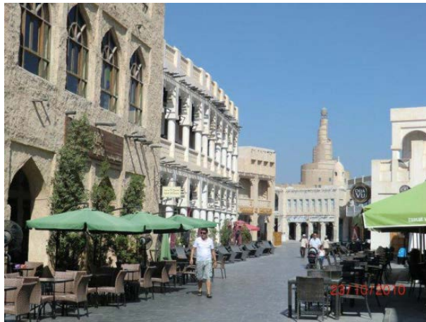
Figure 11. The bustling restaurants area in Souk Waqif.

local community values. Diversity of public areas is important and essential as they ensure the sustainability of a living heritage and to the way in which people interact and identify with their locality. It is therefore, paramount that rehabilitation includes a variety of public areas to strengthen people's sense of belonging (Dix, 1995).