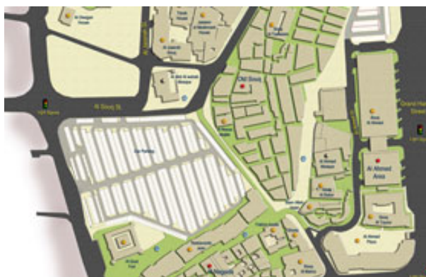
Figure 5. Site plan of Souk Waqif showing the diverse urban spaces.

During the early years following independence, the souk fell into disrepair and decay while alien modern structures replaced the old shops. At this stage, the Souk area was invaded by inhuman buildings, of dense shops frontage, crowded entrances, and clash of functions. The renewal process was randomly done by the individual shop keepers with the absence of a unifying vision among the Souk. Adaptation to enhance the unit quality was merged with the desire to create the modern shopping experience by enlarging the shop area and creating the transparent glass steel facades. This has been accompanied by adding air conditioning window type units in a way that disrupted and harmed the visual quality among the souk corridors (see Figure 6 ).