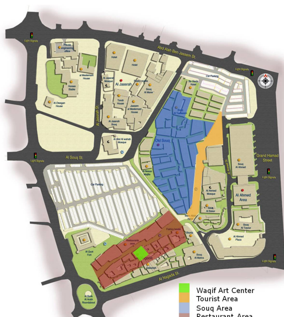
Figure 8. Diversity of spaces in Souk Waqif, ensures its livability and sustainability.