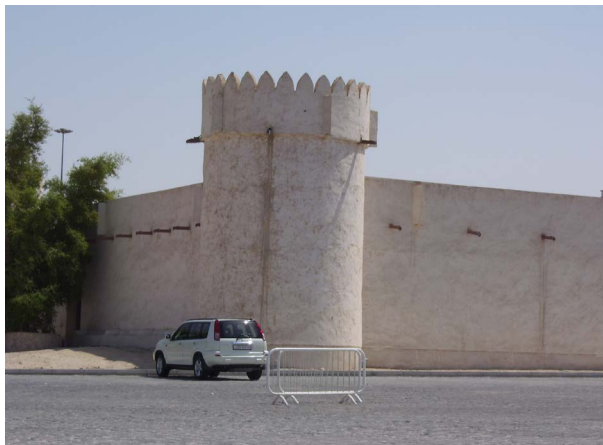
Figure 2. View of Al Koot fort in Souk Waqif.

major turning point in Qatar history. The early 1950s saw a cautious development of government structures and public services under the British tutelage. During the 1960s, new administrative centers sprang up to manage the vast revenues pouring from oil. In 1969, the Government House was opened and today it is considered as one of Qatar's most prominent landmarks. Following the withdrawal of the British, the State of Qatar declared its independence on September 3, 1971. Doha as the capital of the new state, attracted thousands of foreign experts and workers in the construction and engineering, health and education sectors.