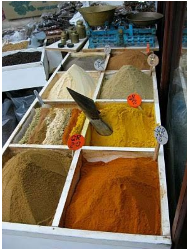
Figure 10. Souk Waqif, the spices corner.