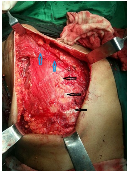
Figure 2. Intraoperative photograph showing exposure of the ribs after removal of a major portion of the pectoralis major muscle. (exposed ribs marked by black arrows and the cut margin of the pectoralis major is marked by blue arrows).