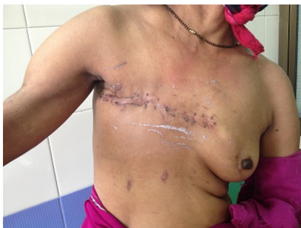
Figure 4. Postoperative state.