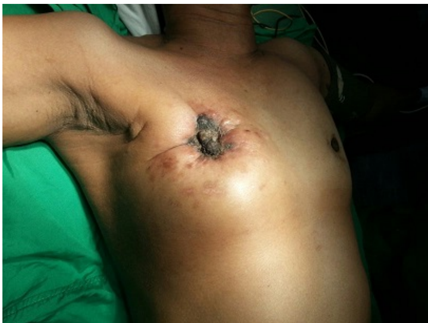
Figure 1. Pre-operative photograph showing a grossly scarred right breast.

Histopathological evaluation of the specimen revealed the mass to be an infiltrating ductal carcinoma. There-section margins were free of tumour. However lymphovascular invasion with involment of 5 axillary lymph nodes was detected. The hormonal receptor status was positive for oestrogen receptors. She is presently under go completion of chemotherapy followed by tamoxifen therapy.