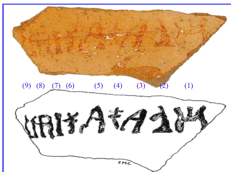
Figure 1. Painted inscription 4.5 on the ceramic ostracon RN 9794 discovered in the area of the ancient Philistine port of Ashkelon.

The analysis of the 27 spellings of Table 1 reveals that the sound value group I U K/GA in spellings 1 - 9, I U LE in spellings 10 - 18, WE LE MI in spellings 20, 23, 26, WE K/GA MI in spellings 21, 22, 25, B/PA K/GA B/PA in the spelling 24 and B/PA LE B/PA in the spelling 27 are unusual and do not indicate possible words if compared with the same sound values groups in the present surviving Slavic languages. But, according to said comparison, the sound value groups of spelling 19: