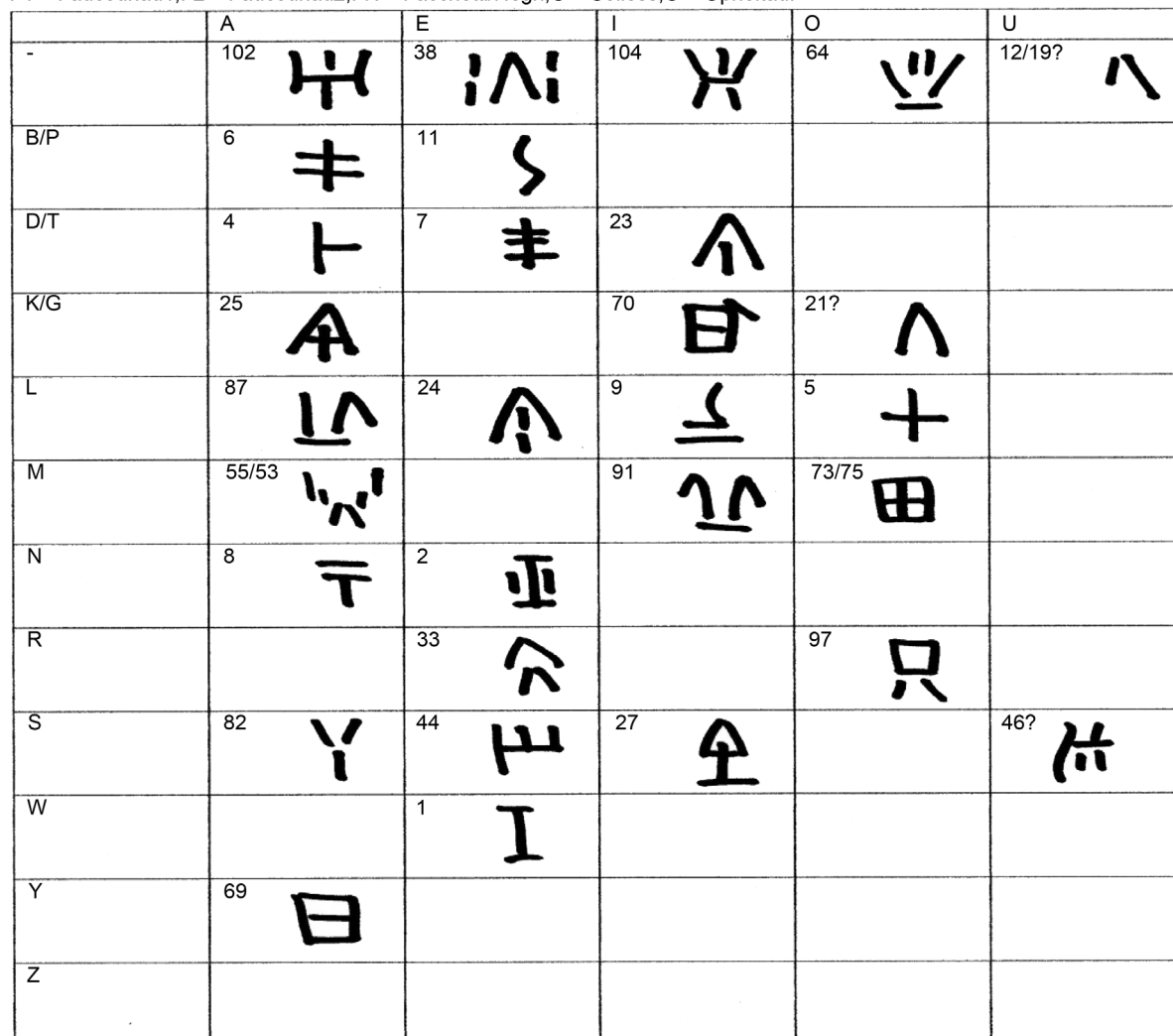
Figure 2. Cipro-Minoan characters with most certain sound values (Lytov, 2015; Facchetti & Negri, 2014; Faucounau, 1977; Faucounau, 1980; Faucounau, 1994; Faucounau, 2007; Colless, no date; Masson, 1994).

F1 – Faucounau1, F2 – Faucounau2, FN – Facchetti/Negri, C – Colless, O – Opheltau.