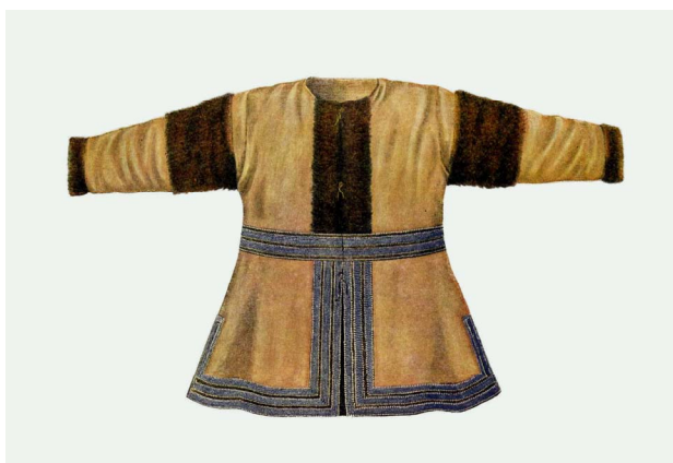
Figure 2. Upper clothes of the Khorolors made of rovduga (Soviet Ethnography, 1936, No. 2-3).

(1), 252; Table VI (6), 309) and they have not anything in common with the traditional clothes of the Mongol peoples, in particular with the Khori Buryats (Figure 3).