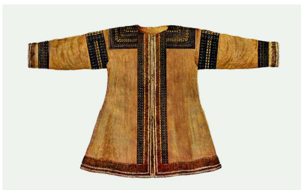
Figure 1. The clothes of the Khorolors richly decorated with braids of leather with a through pattern (Soviet Ethnography, 1936, No. 2-3).

The incorrectness of the hypothesis of the Mongol origin of the Khorolors is illustrated by some other materials. Excavated in 1920 by archeologist Ye. D. Strelov on the ridge of the mountain Lysaya between the Khorinsk and Atlasov folds to the South-West of Yakutsk were two Khorolor burial places in which buried were two women. The degree of conservation of the corpses and their clothes and other things was very good owing to the permafrost. The clothes belong to the middle of the XVIII century judging by the coins and fishes found in the graves. Painter M. M. Nosov skilfully made drawings in color (Figures 1 and 2). One of the clothes was sewn of broad cloth, the other one of thick rovduga, they looked like the costumes of the Evenks (Historical and ethnographic atlas 1961: Table 13