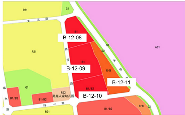
Figure 1. Pingshan village planning area map.

income, but the per capita net income of farmers ping village is higher than that of the east lake village, therefore found that ping, many residents of the village is not engaged in agricultural activities, with more than 2000 acres of land requisition in succession, farmers completely lost, but because of agriculture and forestry university, economy applicable room built around, block to enrage gradual warming, faced with good development opportunities and prospects. In order to solve the problems of farmers and rural areas, Pingshan village adjusted measures to local conditions, focused on the development of the second and third industries, and guided the villagers to change their living habits, leaving the soil for work and joining the market, creating more business opportunities. Therefore, the per capita net income was much higher than that of Donghu village, which was mainly developed by agriculture.