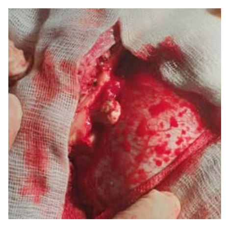
Figure 2. Outpouring of greenish material of the left frontal sinus.