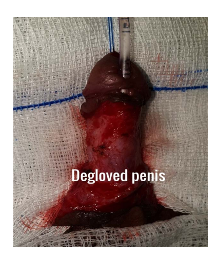
Figure 3. Degloved penis.