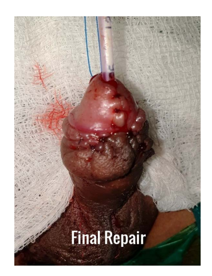
Figure 4. After surgical repair.