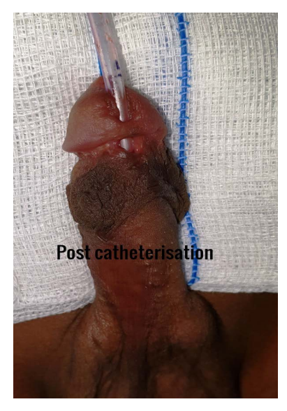
Figure 2. Post catheterisation.