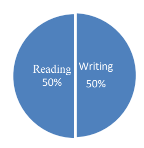
Figure 1. Marks allocation for different skills (English 1st Paper).

tag questions, sentence connectors, punctuations, etc. The composition items include writing a CV with cover letter, writing formal letters/Emails, paragraph writing by listing/narrating/comparison and contrast/cause and effects, and composition writing (Figure 2).