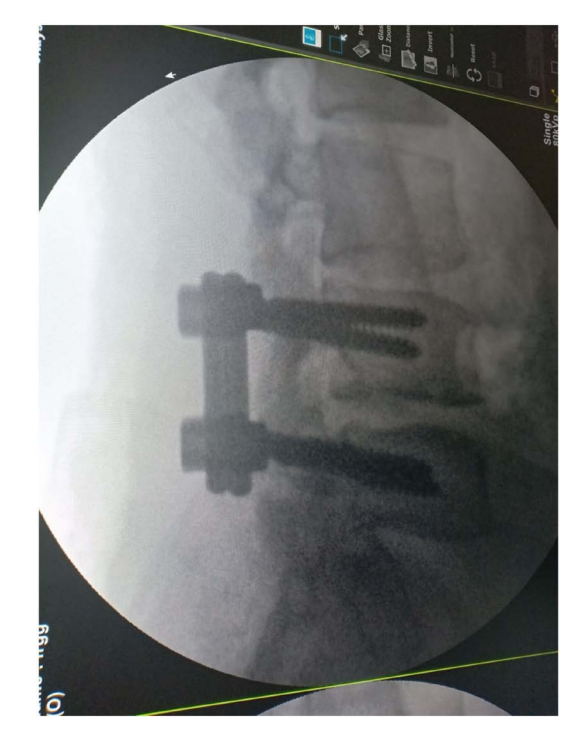
Figure 5. Postoperative plain X-ray lat view shows transpedicular fixation single level L4 L5.

Table 1. Subjective symptoms (9 points). (a) Low-back pain; (b) Leg pain and/or tingling;(c) Gait.