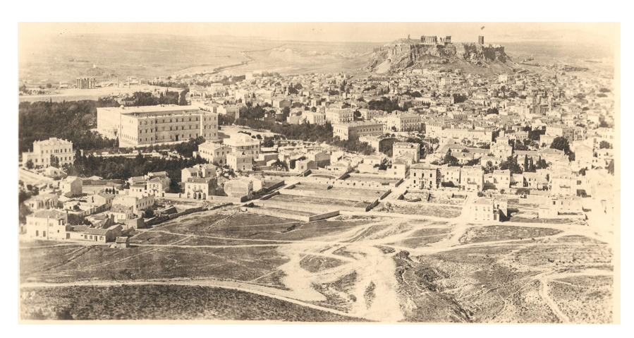
Figure 3. General view of Athens, from Lycabettus hill, in about 1874. In front is the new section of the city with straight streets and new buildings. The palace of Otto is dominant on the left. National Historical Museum, Photography Archive.