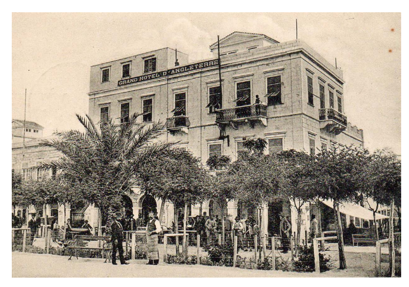
Figure 2. The modern face of newly-built Ermoupoli, Syros. The "England Hotel".

significant linchpin of economic development, with investments in the land and real estate market that made it a strong competitor of industrial investments. The channeling of significant investment capital into the urban land market and into buildings by omogeneis,12 by local merchants, (who invested their profits from the sale of raisins), by high-ranking employees and by wealthy villagers was typical. Significant capital was invested in building houses in Athens by omogeneis and foreign residents who chose the new capital as their home. The image of the private houses confirms that their owners had significant funds and aimed for high aesthetics and construction value. The presence of their homes was intended to ensure their advancement in the society. Virtually all such homes, both in the capital and in other cities, were built with private funds. The state had a very limited participation in the re-construction. The improvement works covered the state's weakness regarding the amount owed to financial difficulties: both the magnificent buildings for public use in Athens (Kasimati, 2010; Kasimati & Panetsos, 2014) and those for similar use in the regional cities (hospitals, schools) were built with contributions from benefactors, almost always in the neoclassical style (Biris & Kardamitsi-Adami, 2004).