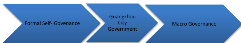
Figure 1. Different forms of governance structures for Ghanaian diaspora community in Guangzhou.

The results as presented in the table explain formal indicators for the measurement of diaspora governance in Guangzhou. Generally, the study participants presented an unsatisfactory score after measuring it with 5 domains of governance measurement adopted for use in this study. Though, Ghanaians considered the formal governance approach as ineffective, the findings did not suggest that