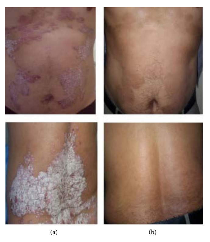
Figure 1. Sixty-two years old patient on the new oral regimen (a) before and (b) after eight weeks of treatment.