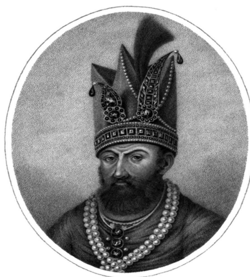
Figure 1. Nader Shah.

Early in XIX century, Araxes river became a border between Russia and Iran after the Treaty of Turkmenchay, according to the terms, north of the Araxes was incorporated into Russian Empire and cut off from the major Shia cities of Qom, Mashhad and Tabriz. Turks remaining in the northern border of river in Russian—held Azerbaijan thoroughly differed from their compatriots remaining in the south of the river; while in the north, regions bordering with Dagestan and Chechens, also to the west part majority were Sunnis, but in the south part of Azerbaijan granted to Iran, Shi'as outnumbered Sunnis, which consequently resulted with involving North Azerbaijan in the secularization process by which to the political difference between North and South part of country was added religious factor [9]. The approach of Tsarist regime to Islam was not even, accompanied with the demonstration of tolerance to avoid forthcoming rebellions or