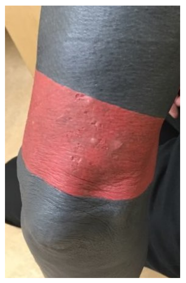
Figure 3. After ten weeks on Acitretin therapy, the lesions had fully regressed and all that remained in their place were a few small crateriform or papular scars without loss of tattoo pigment.