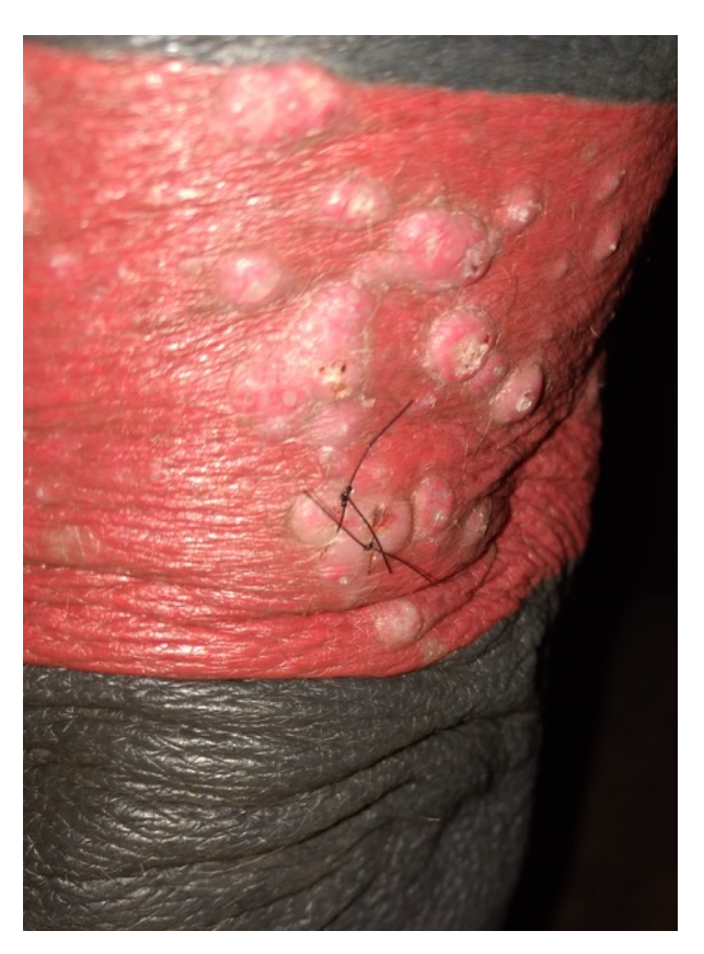
Figure 1. Seen entirely within the red portions of this sleeve tattoo are multiple crusted, crateriform papules clinically representative of keratoacanthomas. This image was taken at the time of biopsy.