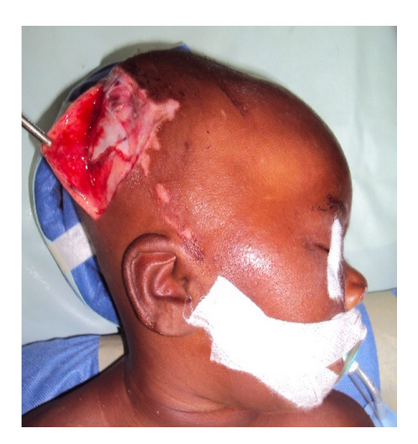
Figure 3. Occipital craniocephaliquewound.