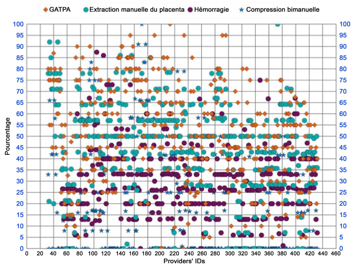
GATPA: Active management of the third stage of labor; Extraction manuelle du placenta: Manual removal of the placenta; Hémorragie: Management of immediate postpartum haemorrhage by uterine atony; Compression bimanuelle: Uterine bimanual compression.

Obstetricians and midwives face extreme emergencies that need to be managed quickly, efficiently and in a team environment. These situations, which are often rare, are serious and must be dealt with by experienced staff. Yet, because of the increasing number of learners and the scarcity of teachers in maternity hospitals, exposure to critical situations has become less frequent. In this study, we identified the inability of some providers to identify obstetric emergencies. Management was affected by the lack of technical skills, but also the importance of interpersonal and interdisciplinary communication problems. Haemorrhage is the most important cause of maternal death in the world. More than half of all