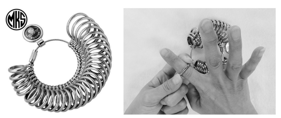
Japan Custom Size standard; ART No. 40610, sizes #1-30; Meikosha Mfg. Co., Ltd., Nagoya, Japan

Figure 1. Ring gauge (Japan custom size).