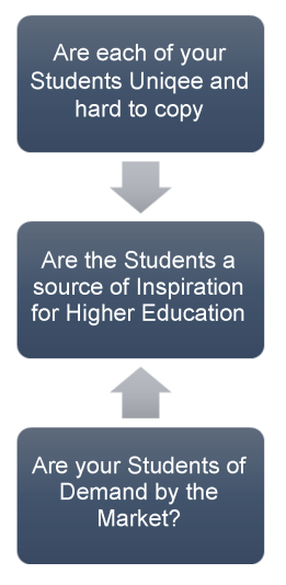
Figure 1. Illustrated the main questions that each school would look for in its students consistently.

Students can have thoughts and moments of inspiration that come from class and extra-curricular activities as these moments are challenged with specific performance the students observation abilities would rise and also their ability to discover opportunities would be higher. This should raise the ability of the students to visualise the big picture [14].