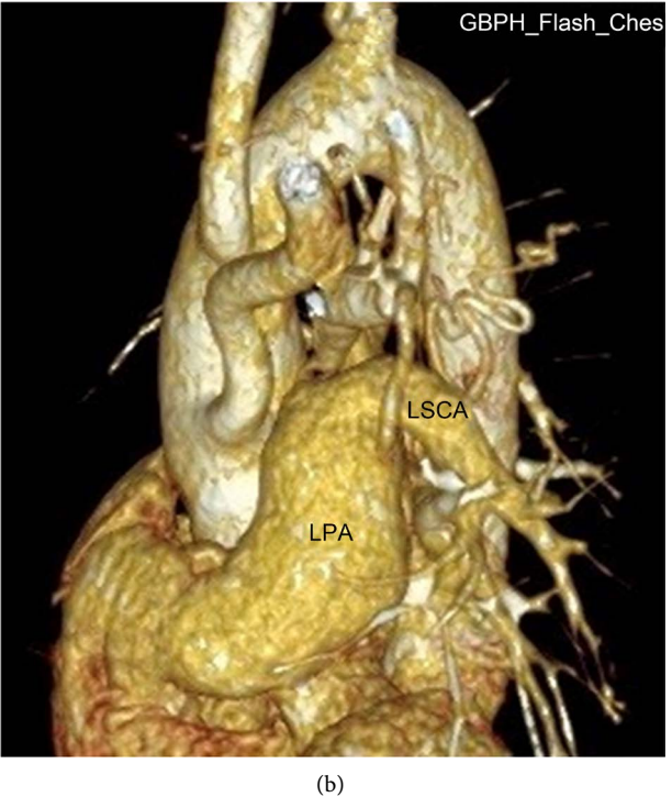
Figure 2. CT angiography 3D reconstruction showing Rt Innominate artery, RCCA and LCCA originating from RAA (a) and LSCA originating from LPA (b).

was no role of embolization as there was no pulmonary artery steal. It was supplied by collaterals from Descending Thoracic Aorta with no connection from the vertebral artery. So the patient did not have any vertebro-basilar insufficiency. In view of a weak pulse volume in left upper limb and anticipating symptoms in the limb as the child grows, we re-implanted the LSCA to LCCA. It was indicated by a