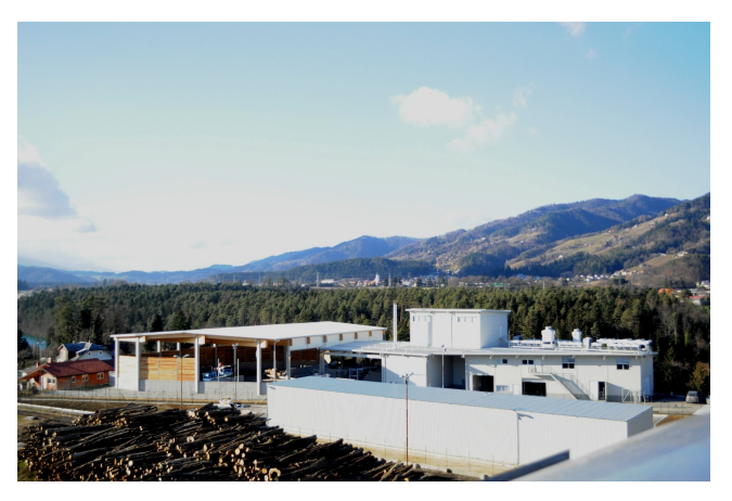
Figure 1. Cogeneration plant.

coolers is used for the wood-drying facility and the heating of a nearby residential area. The heat is sold at a price of EUR 0.02/kWh (Figure 1).