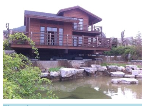
Figure 3. Running water.

hot space to cool down, effectively increase the comfort of the human body. With the evaporation of water, the influence of water on the air temperature in the city is accompanied with the humidity effect. Recent studies revealed that outdoor thermal environment factors, including air temperature, wind speed, relative humidity and solar radiation, affect assessment of thermal comfort, e.g., thermal perception and satisfaction [13]. However, the differences in the comfort of people in different spatial climates are different (see Table 1 ). The humidity level influence how temperatures are felt. High humidity reduces the comfort be maximum temperature; low humidity allows a tolerance for higher temperature. At the lower limit of the comfort level humidity has little influence for individual perception and satisfaction which could be applied in material selection.