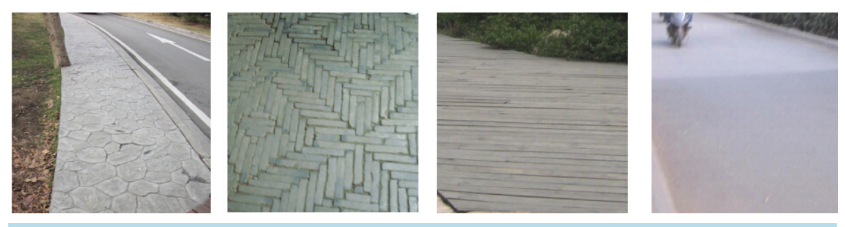
Figure 4. Cement pavement; paving bricks; wood pavement; concrete pavement.