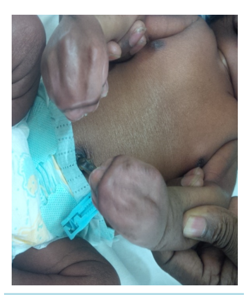
Figure 2. Picture of the hand showing single nail over the matted finger both left and right.