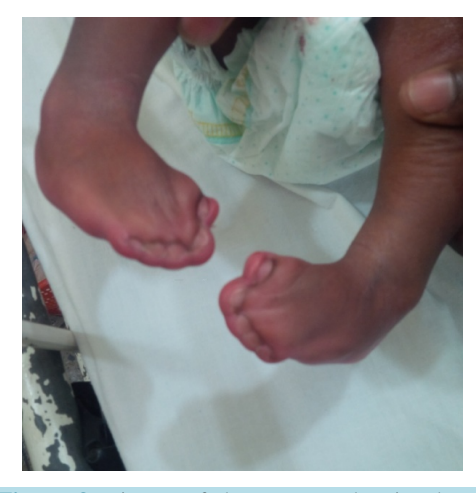
Figure 3. Picture of the neonate showing hoof/ rosebud feet.