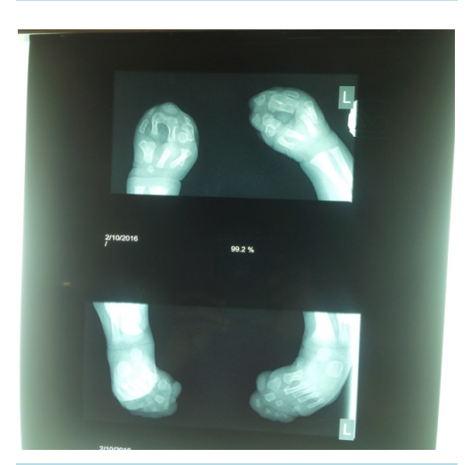
Figure 5. Radiograph of the hands and feet showing fusion of the bones of the digits.