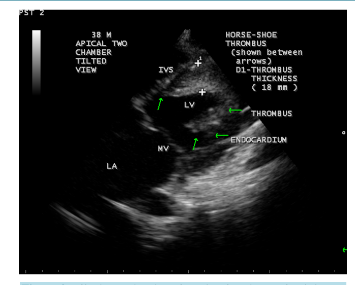
Figure 2. Tilted two chamber view showing the maximal thrombus thickness of 18 mm.