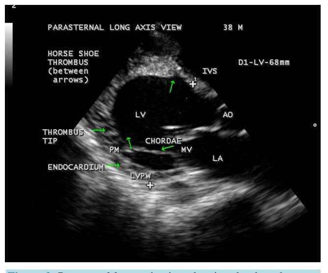
Figure 3. Parasternal long axis view showing the thrombus embedded on the papillary muscle and a dilated LV cavity of 68 mm.

He was treated with antibiotics, bronchodilators and anti-failure measures. He was given a short course of warfarin therapy for one month and no change in the thrombus was observed. Since he developed one or two episodes of mild hemoptysis, warfarin therapy was withdrawn. He developed no embolic events on further follow up of 3 months without warfarin therapy. He died due to acute respiratory failure following a severe asthmatic episode.