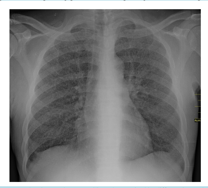
Figure 3. Front pulmonary x-rayshowing a pulmonary miliary characterized by diffuse micronodular opacities bilateral.