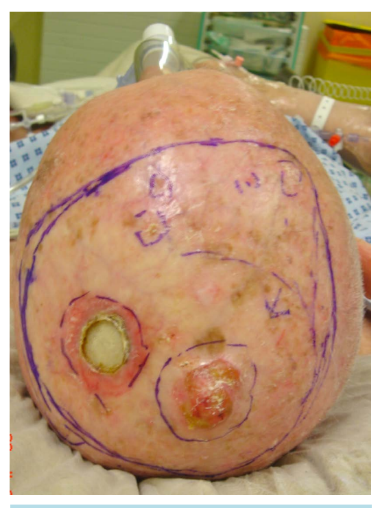
Figure 1. Pre-operative photo showing extensive field change.

Extensive scalp malignancies can involve not only the skin but the underlying soft tissues, periosteum and the calvaria through to dura and cerebrum. Tumours with such rapid aggressive progression are treated with radical