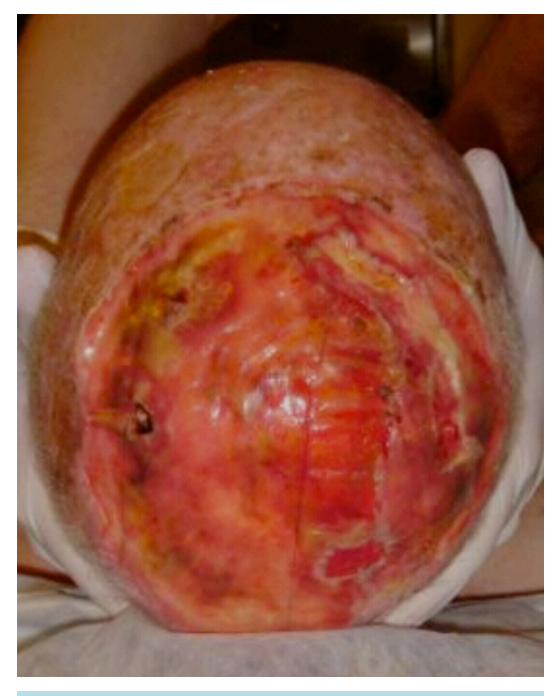
Figure 3. Removal of the outer silicone layer at 5 weeks shows a vascularised bed suitable for grafting.