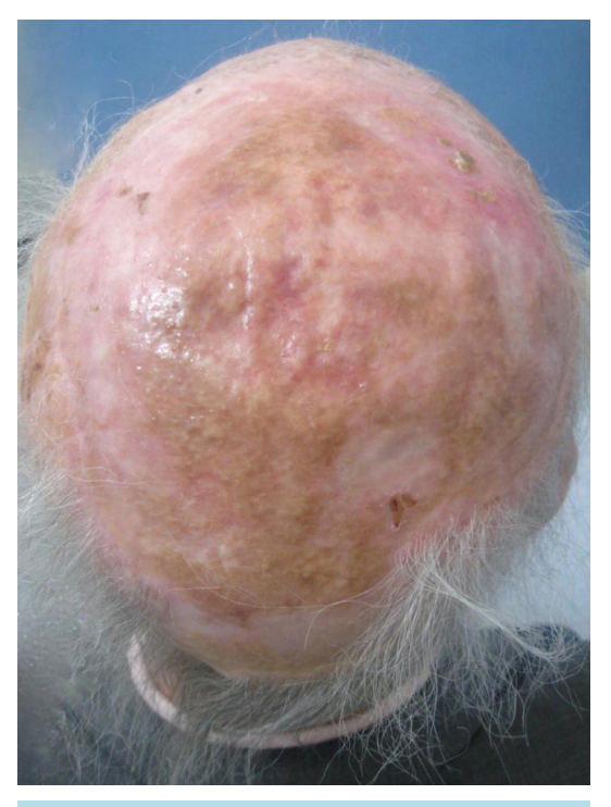
Figure 4. 14 months follow up shows a healthy healed scalp.

One advantage of using Integra<sup>®</sup> is a good aesthetic outcome due to reduced post-operative contracture and scarring. Integra<sup>®</sup> allows the use of an SSG, thereby avoiding physiological demands following free flap reconstruction, risk of blood loss, necrosis and donor site morbidity [1]-[3]. Integra<sup>®</sup> also serves as a biological dressing allowing time for histological confirmation of complete tumour excision.