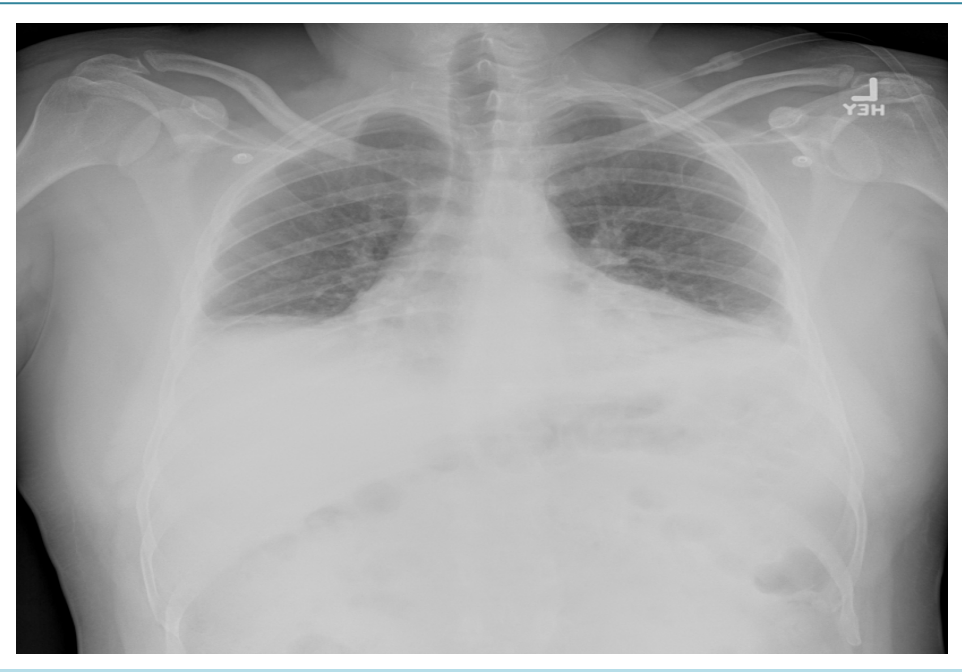
Figure 1. The figure is an erect anterior chest x-ray of the patient showing bilateral pleural effusions and lung opacification. Also noted is hypo aerated lung fields with costophrenic blunting.