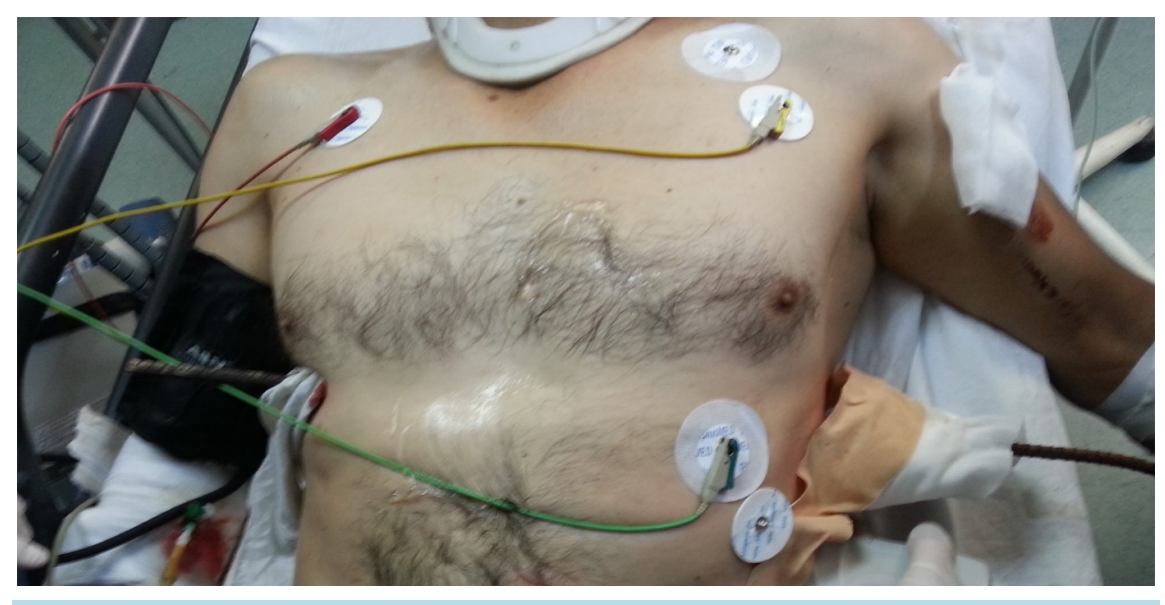
Figure 1. Preoperative wiew.

The thoracic injuries are the third most common injuries among all injuries, after head and extremity [5]. Penetrating thoracic traumas are less frequently observed compared to blunt traumas. Thirty-seven percent of all thoracic traumas occurs due to stab wounds, whereas only 5% occurs by gunshot injuries [2].